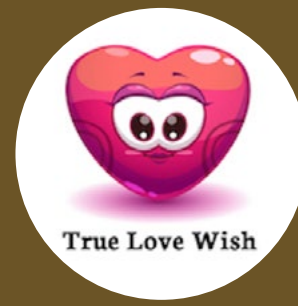
True Love Wish